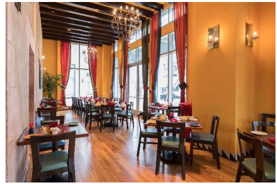
BACK AREA (SEMI PRIVATE)